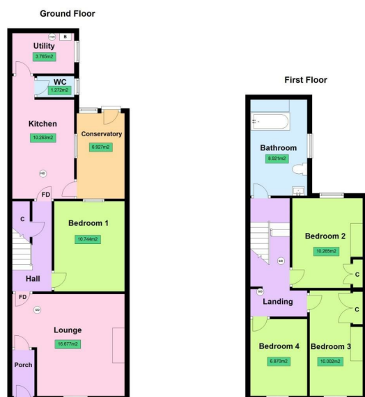
34 Dorset Street, Bath